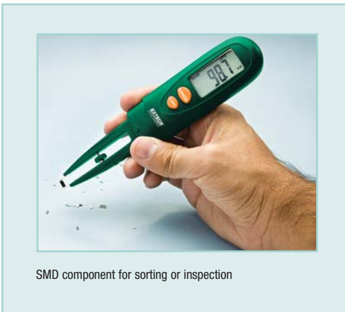
SMD component for sorting or inspection